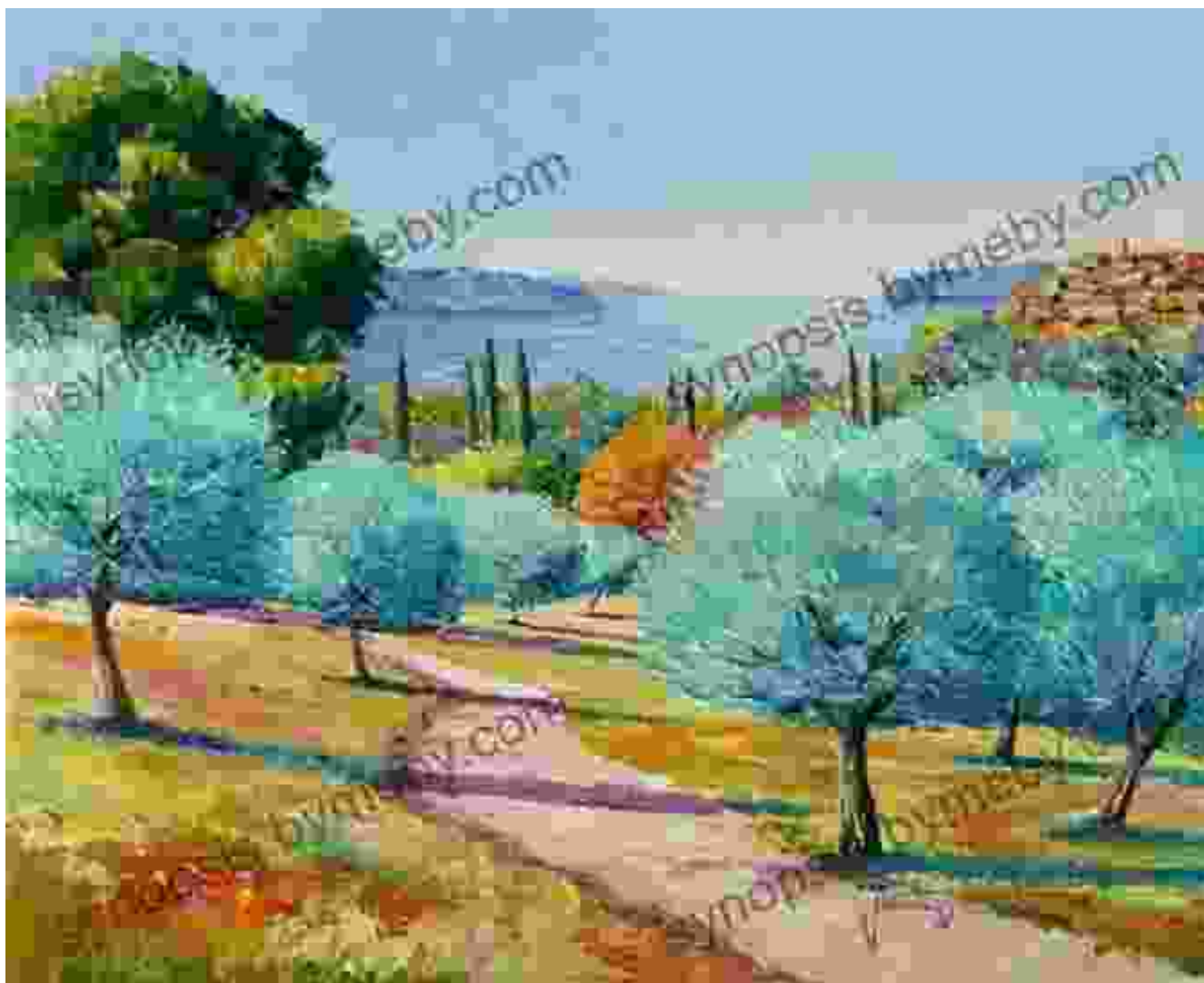
Portraits of Intimacy and Connection

Her brushstrokes were both delicate and expressive, capturing the subtle nuances of nature's tapestry. She had a particular affinity for painting the landscapes of her native North Carolina, finding inspiration in its rolling hills, verdant fields, and vibrant flora.