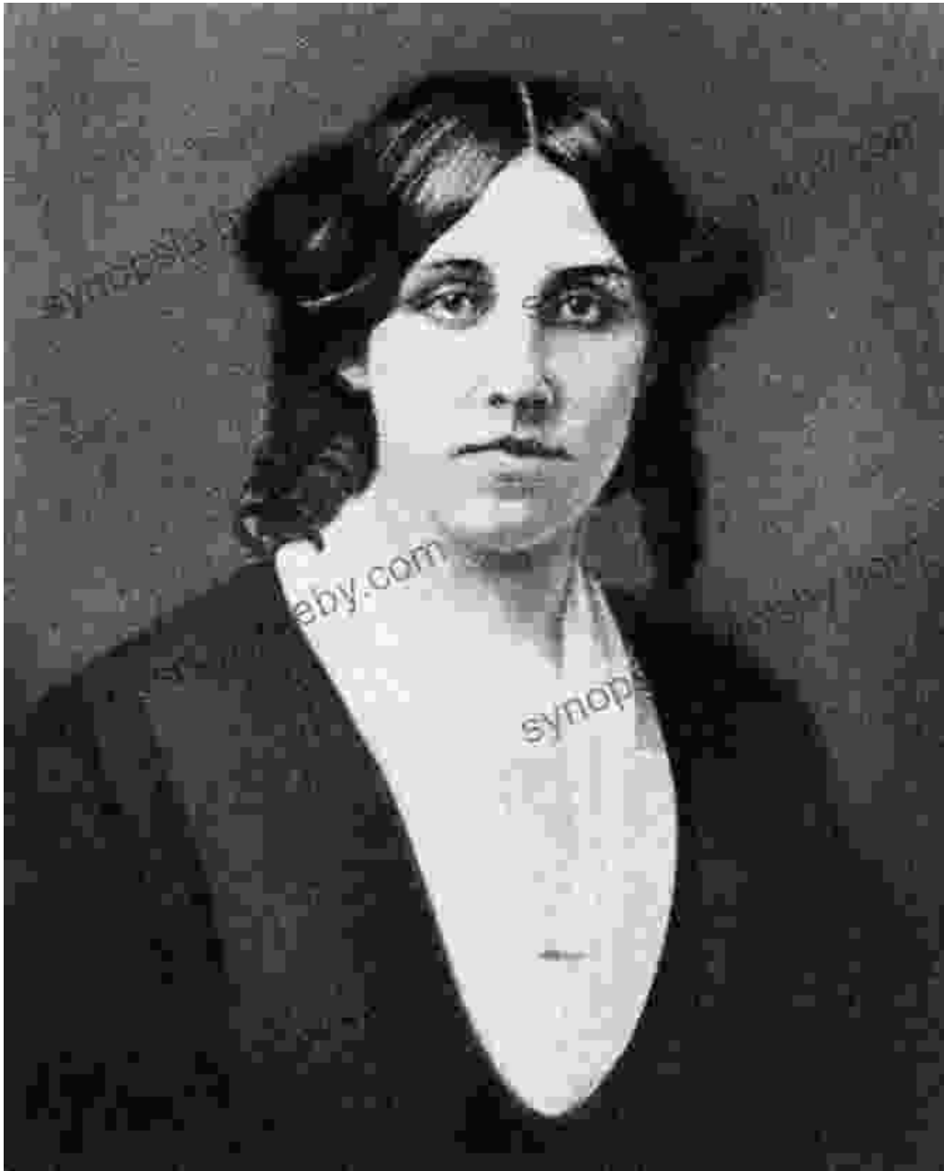
Louisa May Alcott, the beloved author of "Little Women"